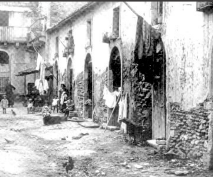
Case Avignone of Messina, where he made his home and started his work.

“These are writings that must now be made known to the world. I believe they will produce great good. For as sublime as this science of the Divine Will is, so do these writings of divine dictation present it, clearly and limpidly. In my opinion, no human intellect would have been able to form them”.